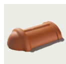
c. Hip End/ Starter