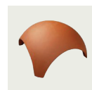
e. 3 Way Apex