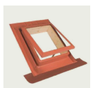
5. Roof Window