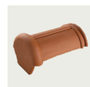
d. Ridge End