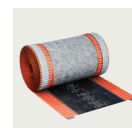
4. Ridge Roll