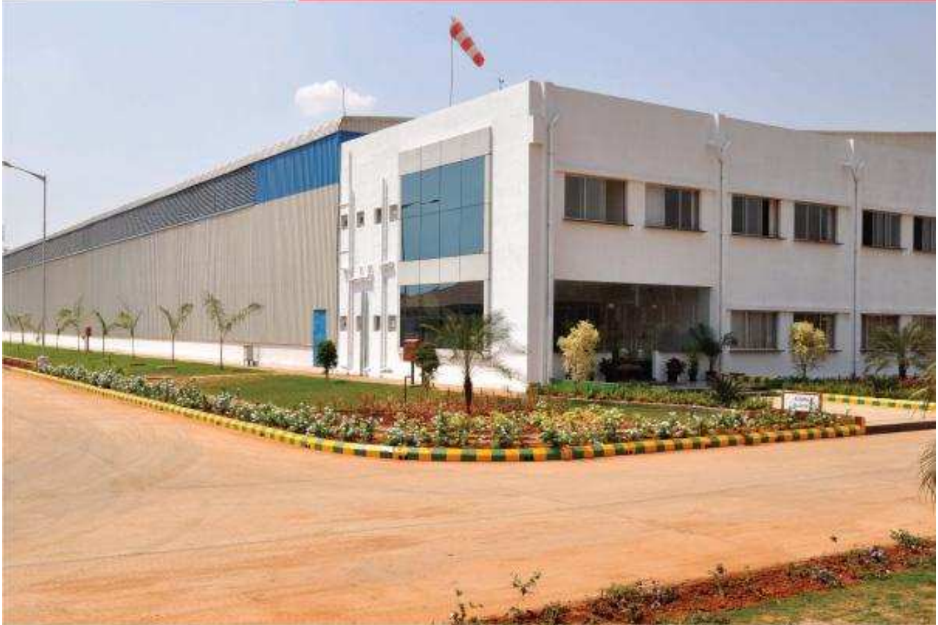
State-of-the-art plant of Wienerberger Brick Industry Pvt. Ltd., Kunigal, Bangalore, India.

Clay bricks have been imperative, healthy and efficient construction material for time immemorial.